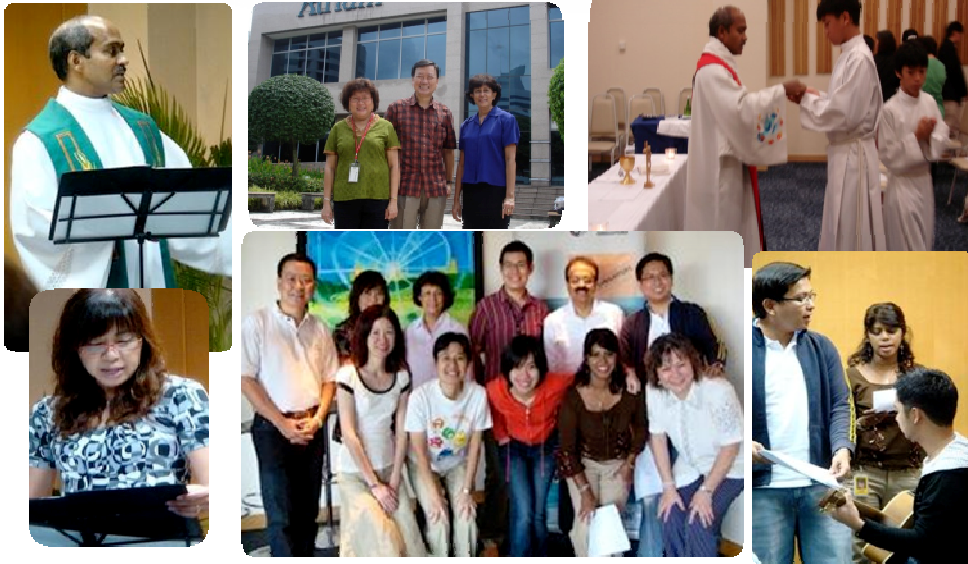
MEMORIES FROM OUR TRESURE CHEST...

Today we celebrate our 3 rd Anniversary, but the memories are still vivid as to how it all began. It was the blessing of God that brought such wonderful people together to make it possible. As a Centre, we hope that the Holy Mass and the Sacraments will touch all our lives, as we grow in faith together.