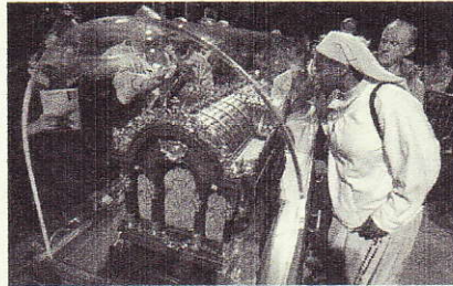
Holy Relics of St. Therese of Lisieux venerated by the faithful during its visit.