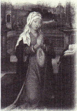
Jean Bellegambe's Saint Anne conceiving the Virgin Mary

On 6 December 1708 Pope Clement XI decreed that the feast of the Immaculate Conception be a Holy Day of Obligation.