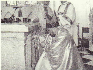
The Bishop consecrates the altar table and placing some relics of Saints in it.

Thus, the Church has communion in the Faith, the Sacraments (above all the Eucharist), the charisms, the Lord's goods, and charity. These riches are communicated to Christ's Body through the Sacraments. Those in the Church partake of these goods received from Christ; these holy things from God make us holy people, which bring us back to the usual understanding of the "communion of the saints" (CCC 949-952)